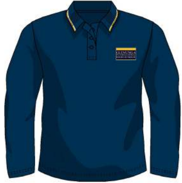
LONG-SLEEVED POLO SHIRT