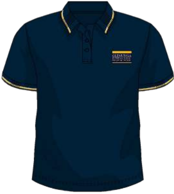
SHORT-SLEEVED POLO TOP