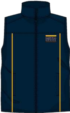
SOFT SHELL VEST