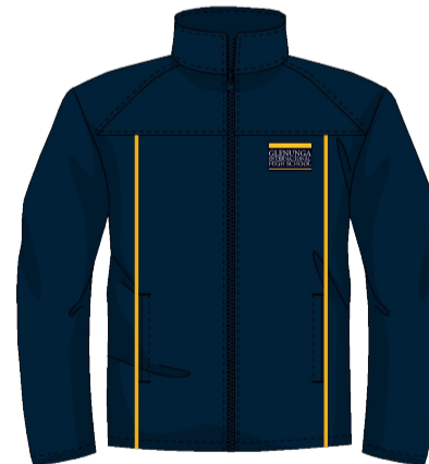
SOFT SHELL JACKET