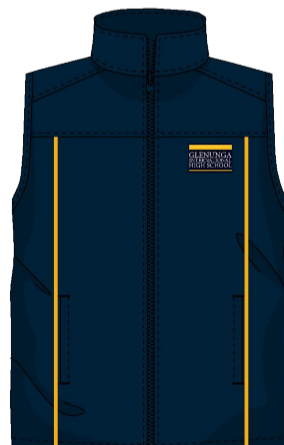
SOFT SHELL VEST