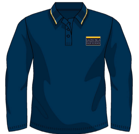
LONG SLEEVE POLO TOP