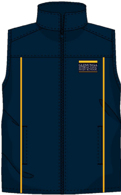
SOFT SHELL VEST