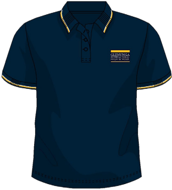
SHORT-SLEEVED POLO TOP