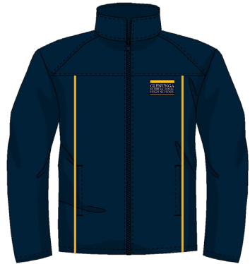
SOFT SHELL JACKET