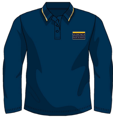
LONG-SLEEVED POLO SHIRT