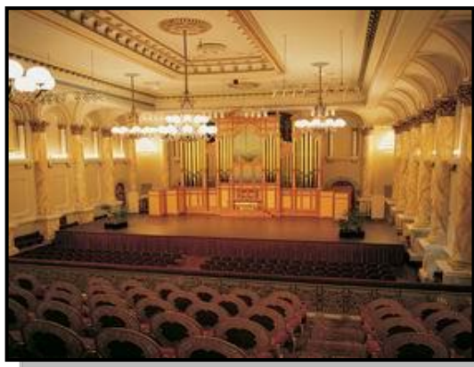
Adelaide Town Hall; venue for the IB Awards Ceremony

An awards ceremony is held at the beginning of February each year in conjunction with the other IB schools in South Australia for students who achieve one or more Grade 7's in their final exams.